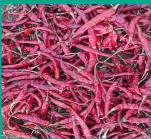
Dry Red Chilli